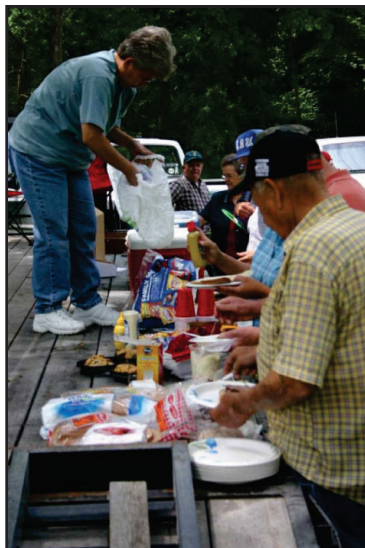
Members enjoy a catered lunch at the Smith Farm southwest of Clayton, IL.

Some 26 members and guests attended the meeting. A short business meeting kicked off the event with a discussion of current state legislation affecting forestry. Members were urged to make their presence known at the local office of their state representative and senator and to voice their opinion concerning several bills which would affect their forestry operation. Also, District Directors urged those in attendance to set up an IFA recruiting table at local events, such as county fairs. Banners, applications, and brochures are available from the state IFA headquarters to aid in this effort.