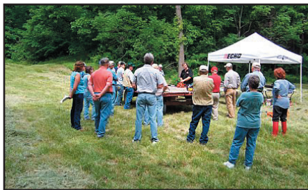
Region 2 IFA members and guests are instructed in chainsaw maintenance at the Forestry Workshop at the Smith Farm.